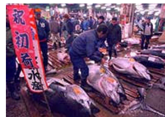
Fish brokers examine tunas at the year’s first auction at the Tsukiji fish market in Tokyo.

The auction kicked off shortly before 5 a.m. after market officials conveyed their New Year’s greetings in a ceremony under a banner that read “Congratulations for the Year’s First Cargo Arriva