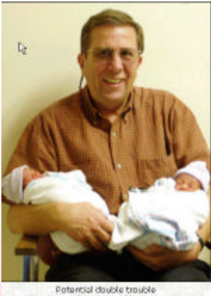
Potential double trouble